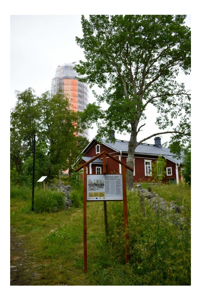
Photo 20. Site 8. Seksmiilarin saaristo. The semi permanent info board in Isokari island. The beautiful light house behind the info board was under renovation in summer 2020.