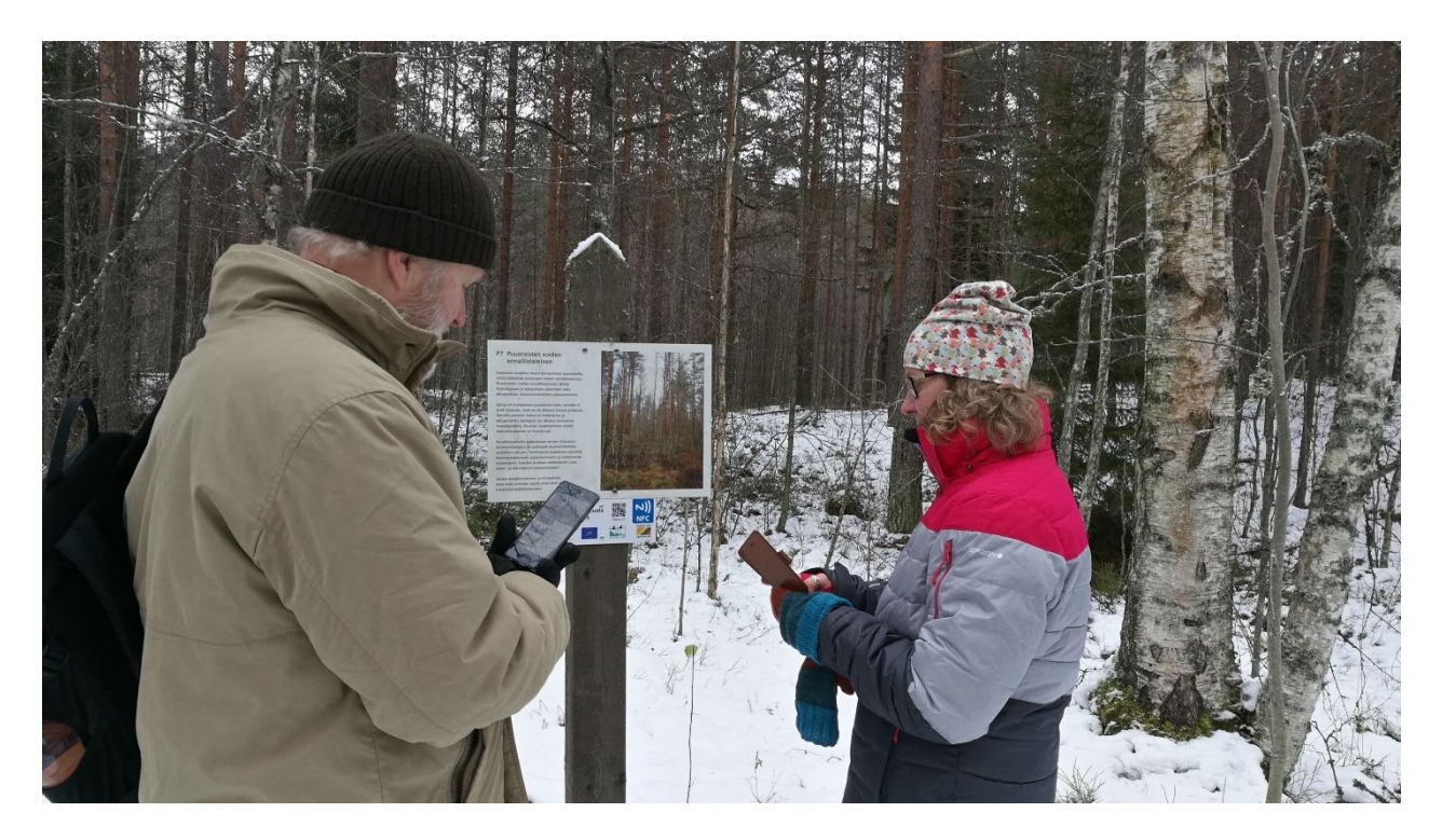
Photo 22. Site 20. Maakylä-Räyskälän alue. Along the restoration nature trail, there are different kind of information boards. Here is the new small extra info bord with QR code, which leads the visitors to more information in the www.