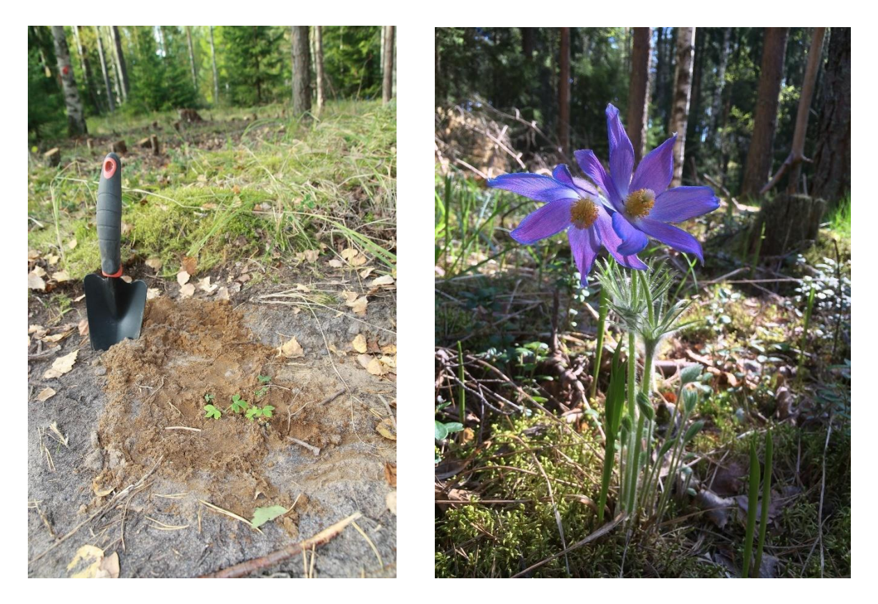
Photos 15. & 16. Photo on the left, 2-year-old seedling of Pulsatilla patens, just planted to the site. Photo on the right, flowering Pulsatilla patens.

In the site 11. Fagerinmäki-Kyöpelinvuori we conducted restoration actions of Pulsatilla patens habitats for area of 1,2 ha and we announced the site to be ready in midterm report 2017. Anyway, we had to do more restoration work in the area because after the thinning operation in 2016 the habitats got much lighter and that caused lots of coppicing. In 2019 we cleared the coppice and girdle some of the big birches and aspens. We also conducted some new patch scarification (patches size 5-10 m<sup>2</sup> all the way to the mineral soil) in the south-west side of the area. Map of the area as annex 116.