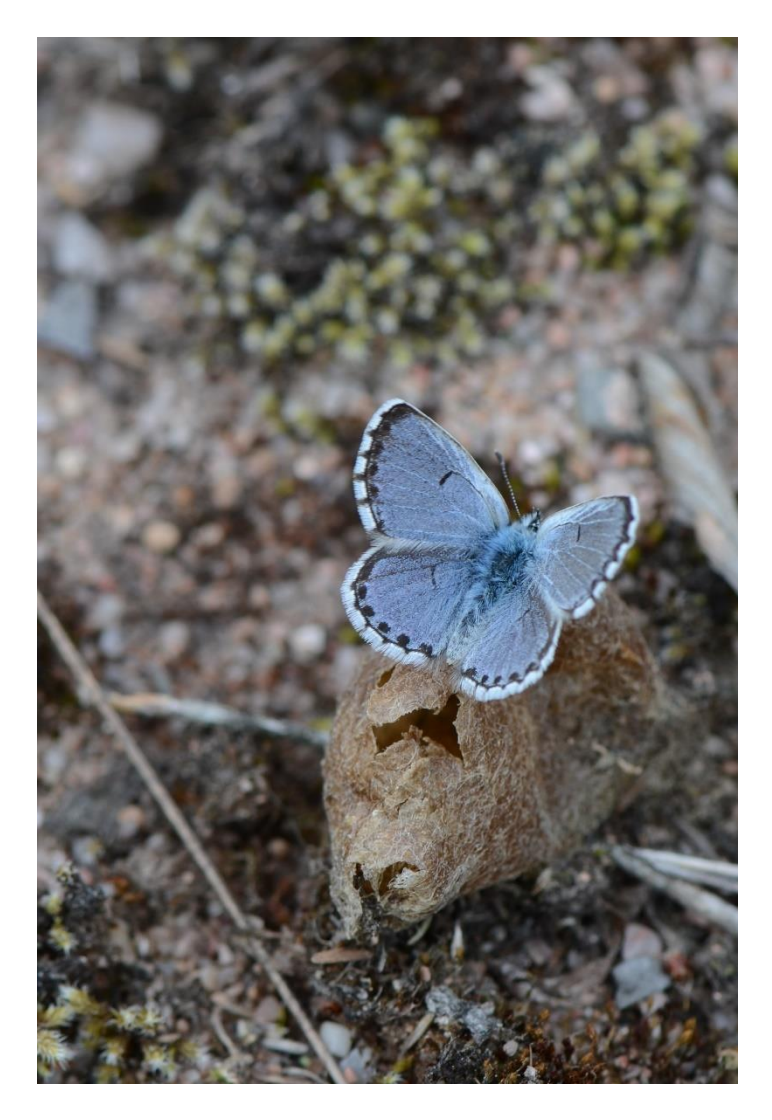
Photo 2: Critically endangered Eastern baton blue (Pseudophilotes vicrama) is one of the species that are dependent on open sun lit environments.

Cultural heritage inventories are completed at all 56 sites, annex 14. There were two ways of conduct the cultural heritage inventories, inspections were done only by maps, satellite data and other sources, they were quite light, but there was no need for more inventory actions on those sites. There are no certain reports from inspections of the sites, only one report, where they are all gathered, this was delivered to the EC as annex of the MtR. This situation was discussed with the External monitor on the last monitoring of the project in August 2020. The surveys were more detailed and larger scale than inspections. Cultural heritage inspections were changed to inspection sites, mostly due to the location and or the size of the restoration site. Some restoration sites were in certain areas, where the archaeologists did the inspections only via maps, satellite images and older info of the sites and the results showed that there was no need for more precise surveys. There was one extra inventory and survey done for the site 2, due to the needs to conduct the restoration measures carefully. Inventory reports were delivered to Commission as annexes of the earlier reports. One extra report of the site 2 is enclosed as annex 19.