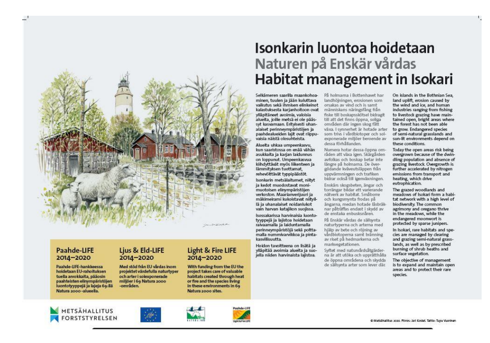
Photo 19. Site 8. Seksmiilarin saaristo. The content of the info board.