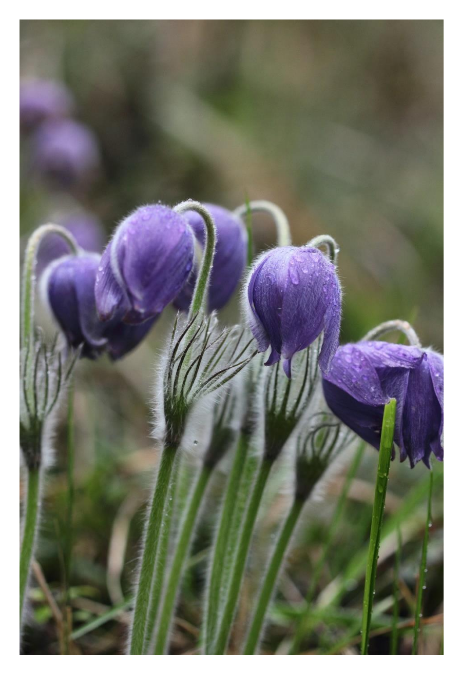
Photo 3. Pulsatilla patens monitoring and translocation plan was made in the project to help this delicate and rare beauty.

monitoring of Pulsatilla Patens at 7 project sites. Pulsatilla translocation plan sent to Commission as annex of PR1.