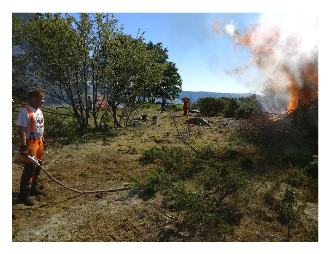
Photo 17. Volunteers doing hard labor for the nature in the beautiful surroundings of site 8. Seksmiilarin saaristo, in Isokari in 2017.

Action progressed mainly according to the plan presented in the Inception report. 9 restoration camps (68 camp days) were organized. Altogether 180 volunteers (on average 20 volunteers per camp) took part. Volunteer work camps have been organized successfully and without problems. All the camps were extremely popular, they were filled with volunteers immediately on the first hours of registration. The work that volunteers did in the Natura 2000 sites was important and effective. In many sites, there were lots of tasks, that could not be done by machines, and hiring such a lot of labor would have been expensive. The total area that the volunteers managed in 6 N2000 sites was 50 hectares. In each long camp the volunteers had one day off to rest and explore the nature. The camps have also had high media visibility even on the national level. The details of the camps are shown in the table, annex 122.