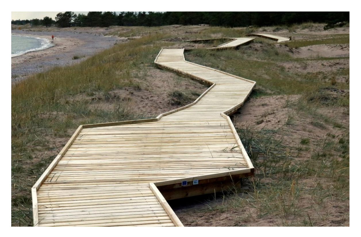
Photo 14. Wooden boardwalk, wide enough for wheelchairs and baby carriages is now tempting walkway on Site 2. Tulliniemi's famous beach. It protects the dune habitats.