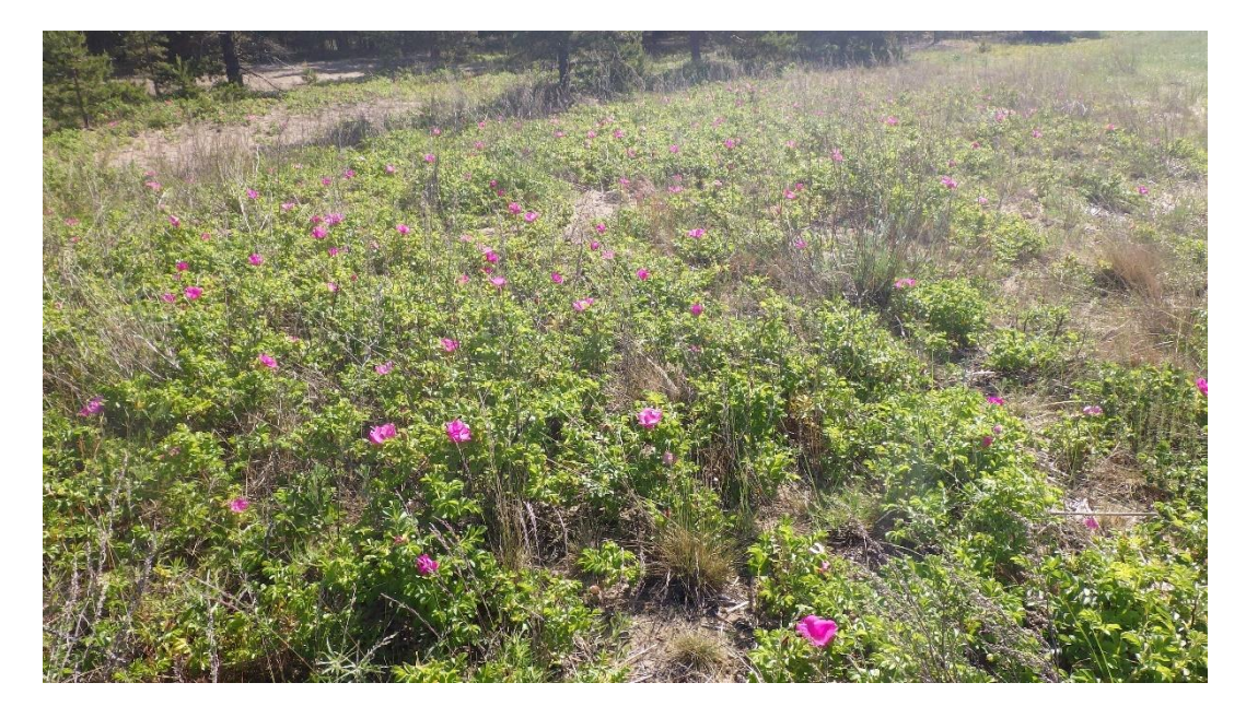
Photo 12. Site 1. Tammisaaren ja Hangon saariston ja Pohjanpitäjänlahden merensuojelualue. Before the restoration actions, the beach was full of alienate Rosa rugosa in 2018.