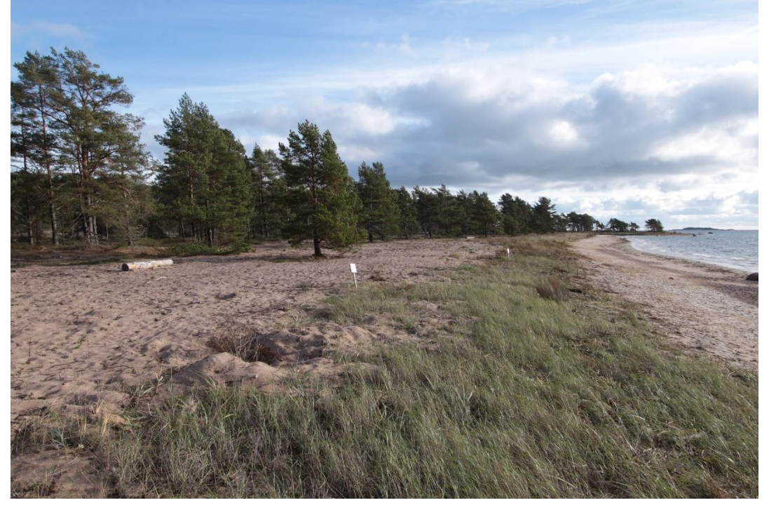
Photo 13. Site 1. Tammisaaren ja Hangon saariston ja Pohjanpitäjänlahden merensuojelualue. Same beach after several years of restoration and eradication of Rosa rugosa, in 2020.