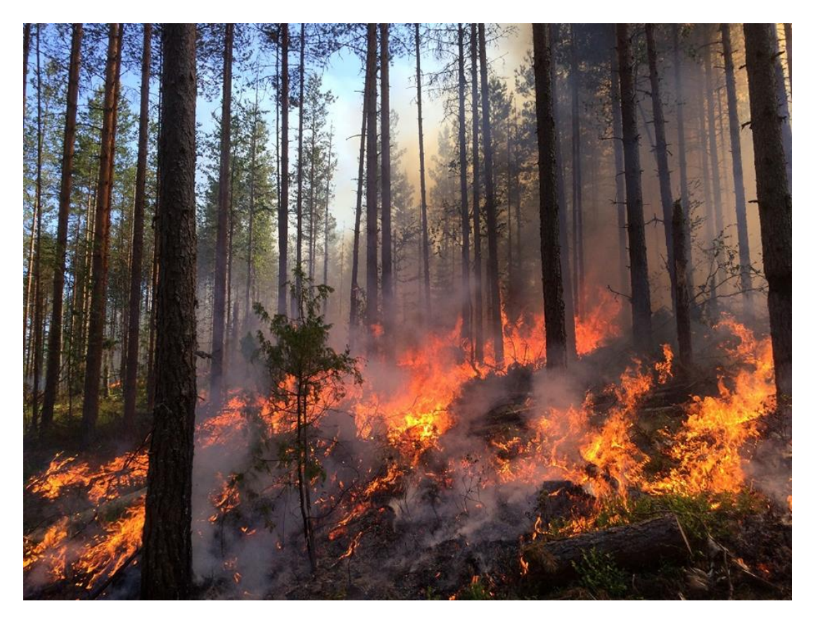
Photo 11. From most of the burning sites in Southern Finland, excess trees must be removed before the burning, due to safety reasons and for controlling the intensity of the fire. Burning in the site 20. Maakylä-Räyskälä 1.6.2016