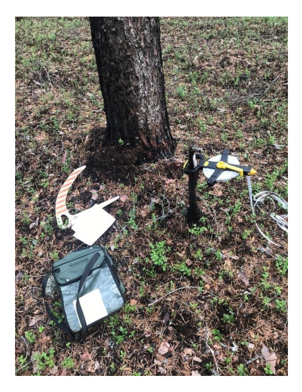
Photo 18. Monitoring of action C1 included forest measurements.

The results will be used in future planning and conducting the restoration measures. Monitoring reports as annexes 124-214.