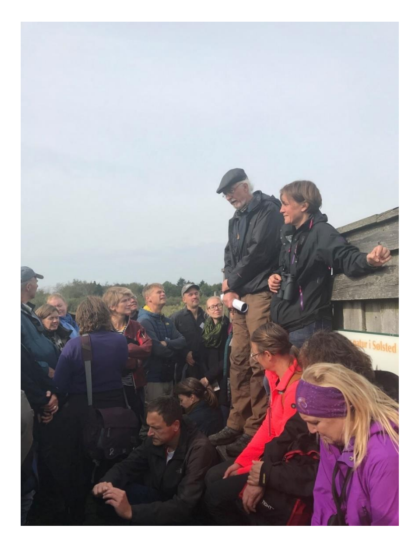
Photo 24. It is always a pleasure to network with people. And delightful to find out different kind of biotopes and restoration acts. The group on bird watching tower in Nordic Platform Meeting in Denmark in September 2019.