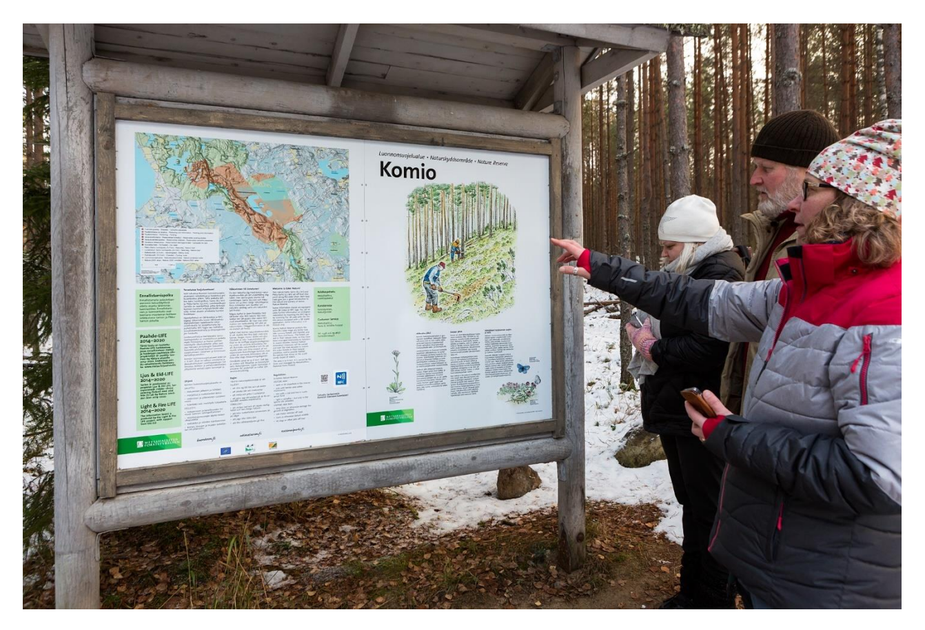
Photo 21. Site 20. Maakylä-Räyskälän alue. The beginning of the restoration nature trail, with two big (A0) information boards attracts trekkers.

We were supposed to held small inauguration of the trail in the spring 2019 or 2020. We postponed it to 2020 and due to Covis-19 situation, could not held it. After all the trail has attracted many nature lovers and the information given there is important, because the restoration actions in the area are really visible and all of them are not so charming, like the restoration burnings for couple of years after burning.