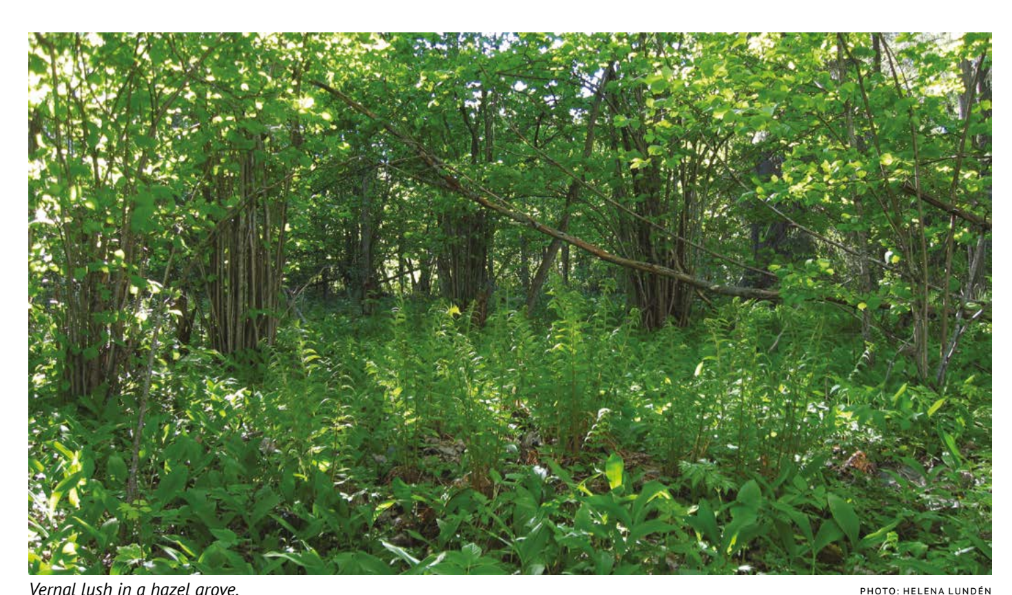
Vernal lush in a hazel grove.