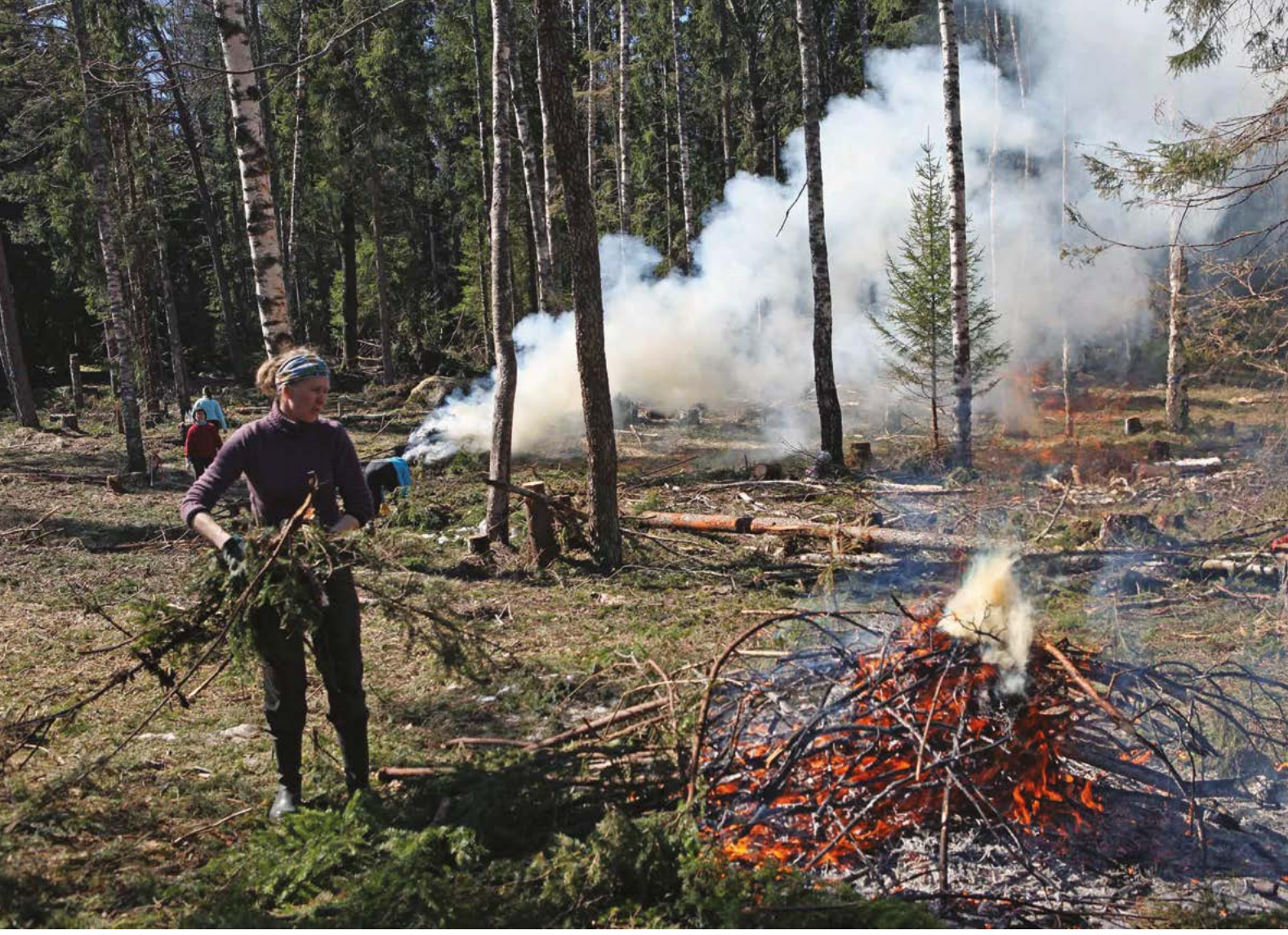
In semi-natural grassland site in Davits, Kirkkonummi, restoration was first carried out by forestry machinery, and volunteers helped to clean up the landscape before grazing animals arrived.