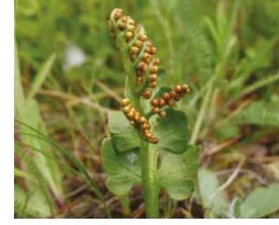
Northern Moonwort (Botrychium boreale)