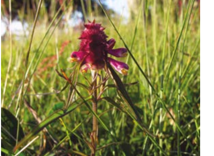
Crested Cow-wheat (Melampyrum cristatum)