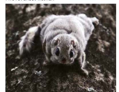
Flying squirrel (Pteromys volans)