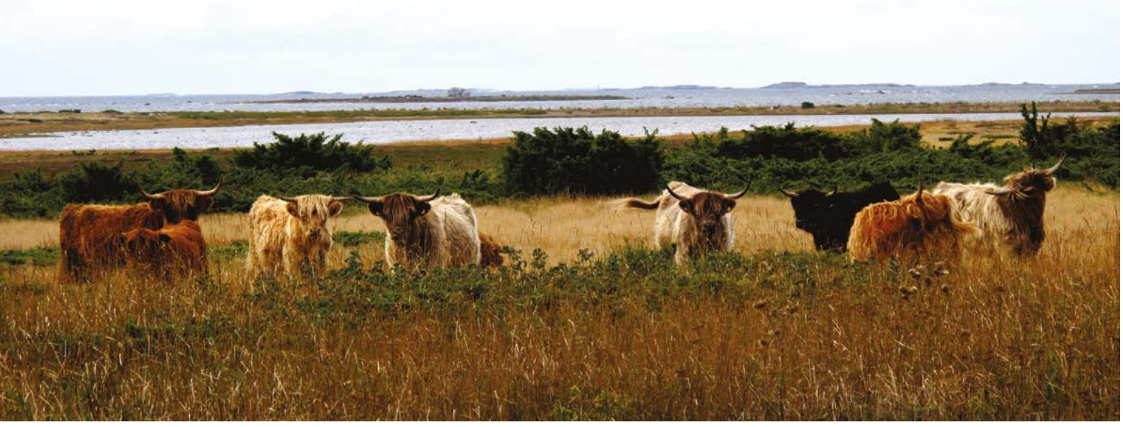
Grazing is the only practical method for preventing the overgrowing of extensive seminatural grassland areas by trees and bushes.