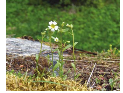
Wedgeleaf Saxifrage (Saxifraga adscendens)