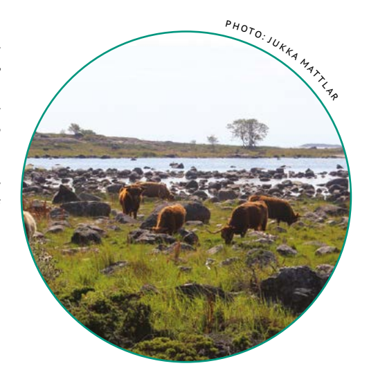
Highland cattle grazing in Archipelago National Park.

Semi-natural grasslands created by traditional farming practices are some of the most threatened ecosystems in Finnish nature. They cannot be preserved without continuous management, including annual arazina or mowina.