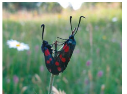
Six-spot Burnet (Zygaena filipendulae)