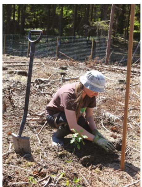
Oak (Quercus robur) seedlings were planted in Nuuksio National Park.