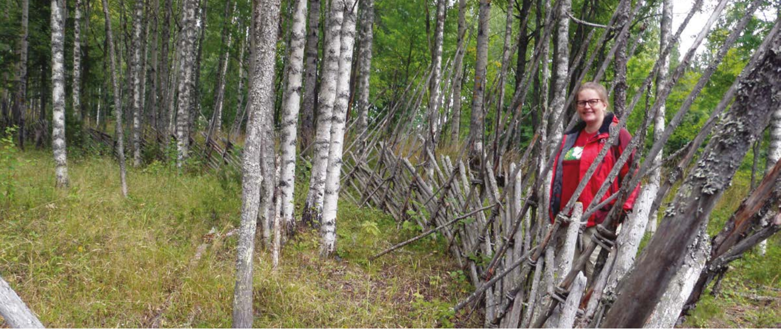
Traditional slash-and-burn agriculture and cattle grazing are practiced on Telkkämäki heritage farm.