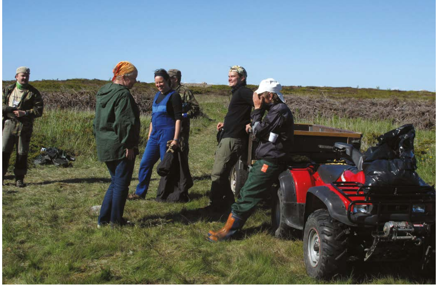
Collaboration of Metsähallitus Parks & Wildlife Finland, WWF Finland and volunteers was essential for restoring the magnificent heathlands on Jurmo Island.