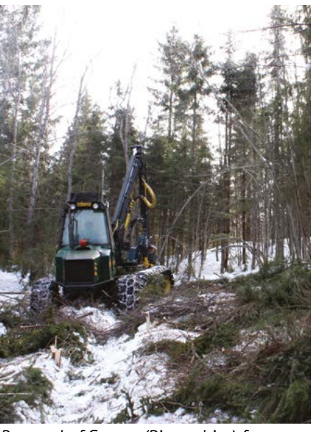
Removal of Spruce (Picea abies) from herb-rich forest.