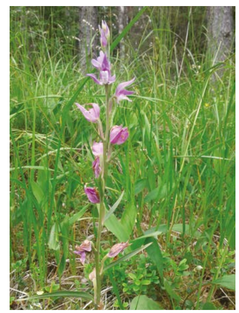
Critically endangered Red Helleborine (Cephalanthera rubra) is a beautiful orchid found in herb-rich forests on calcareous soil.